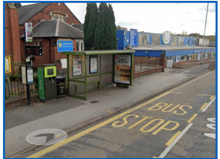
Daybrook Square bus stop on Mansfield Road heading into City