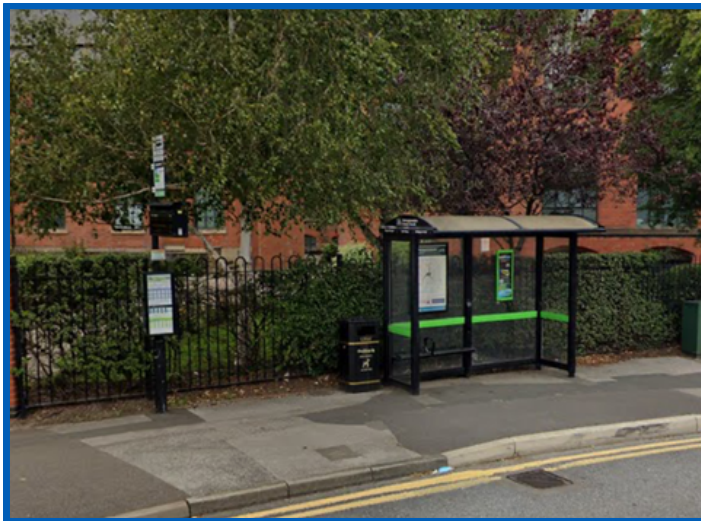
Daybrook Square bus stop on Nottingham Road heading into Arnold