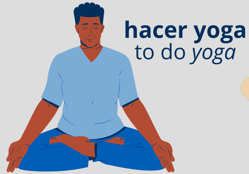
hacer yoga to do yoga