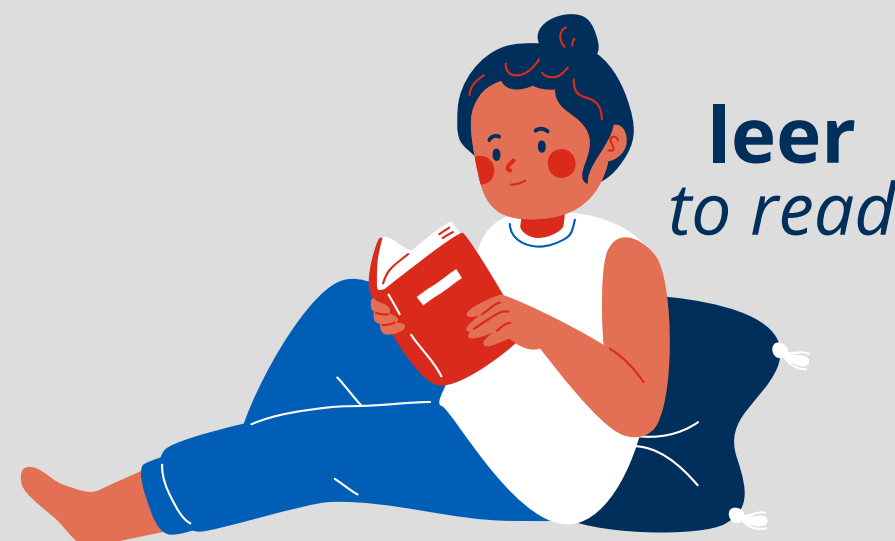
leer to read