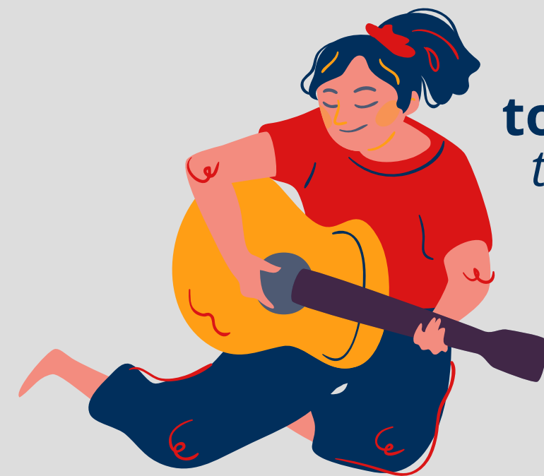
tocar la guitarra to play the guitar