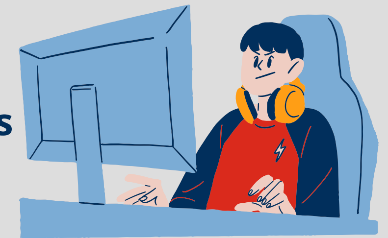
jugar a videojuegos to play video games