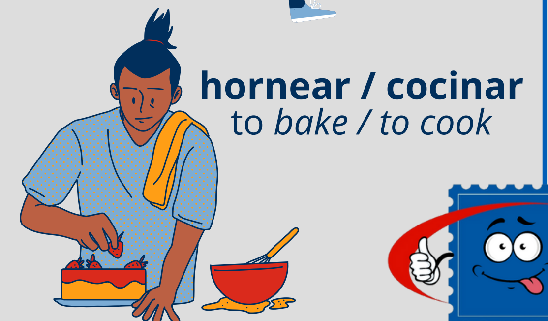
hornear / cocinar to bake / to cook