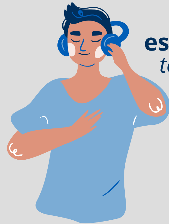
escuchar música to listen to music