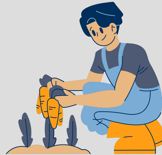
plantar to garden