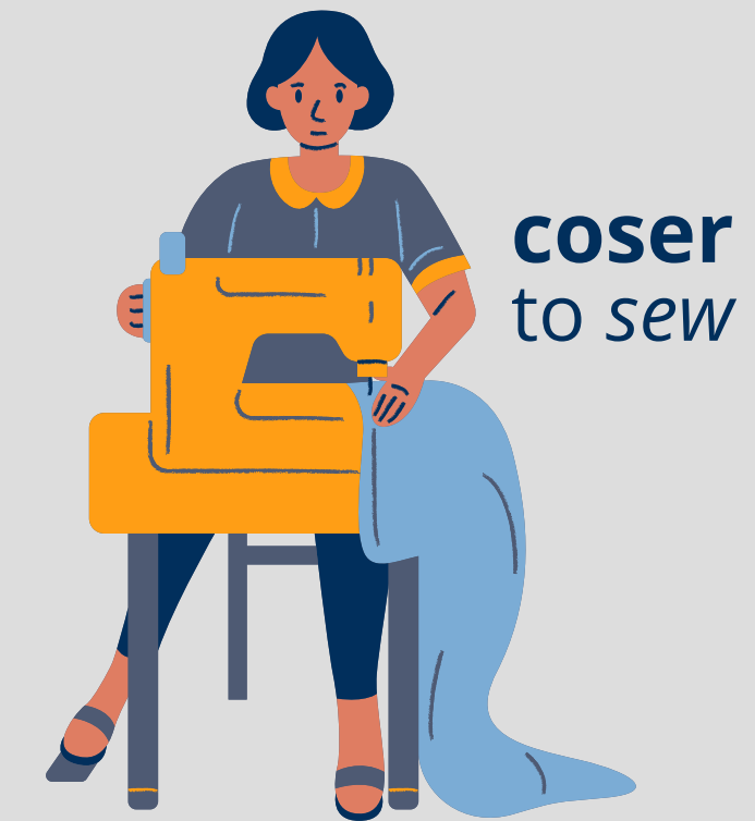
coser to sew