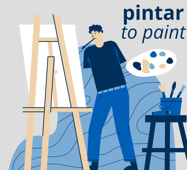
pintar to paint