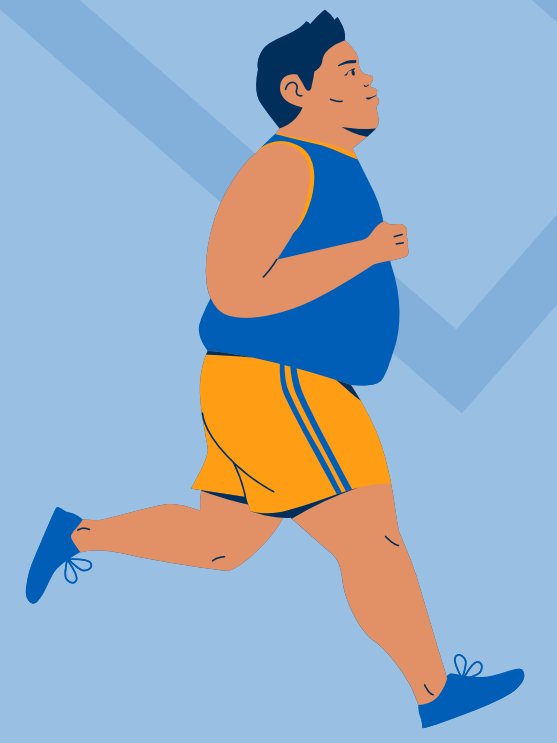
la course à pied running