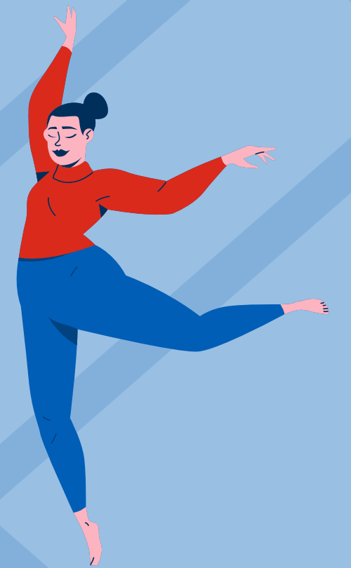
le ballet ballet