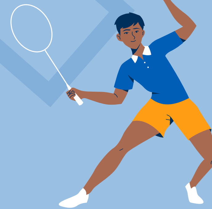
le badminton badminton