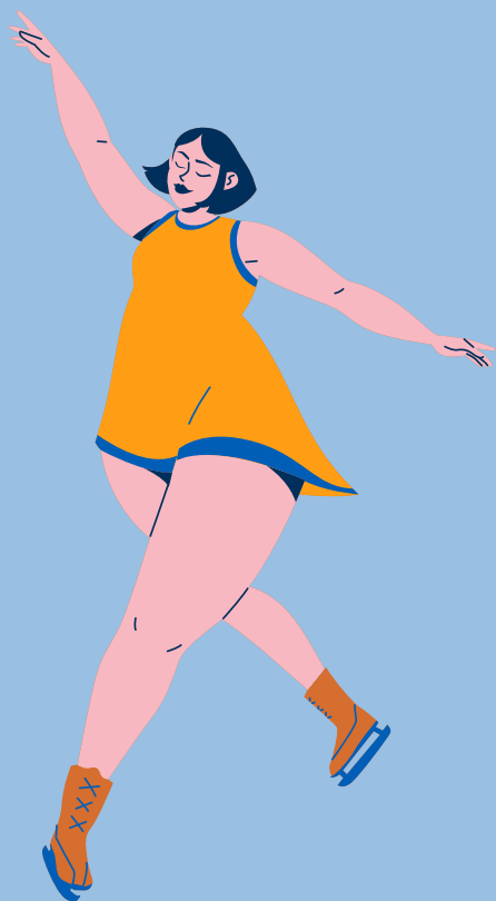
le patinage artistique figure skating