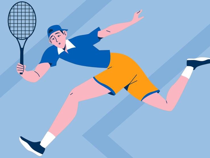
le tennis tennis