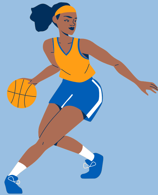
le basket basketball