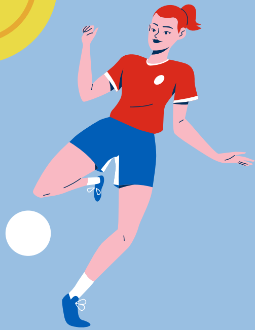
le foot football