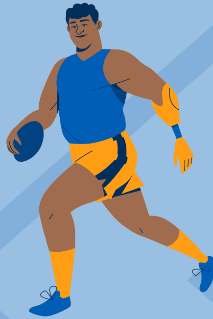
le rugby rugby