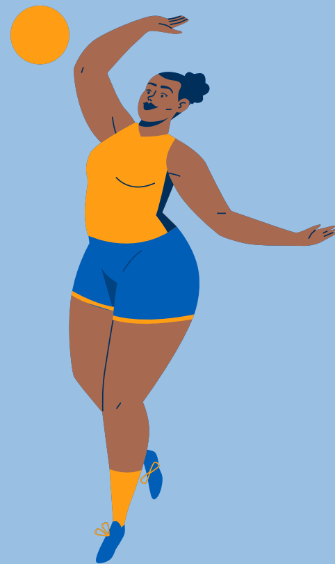
le volley volleyball