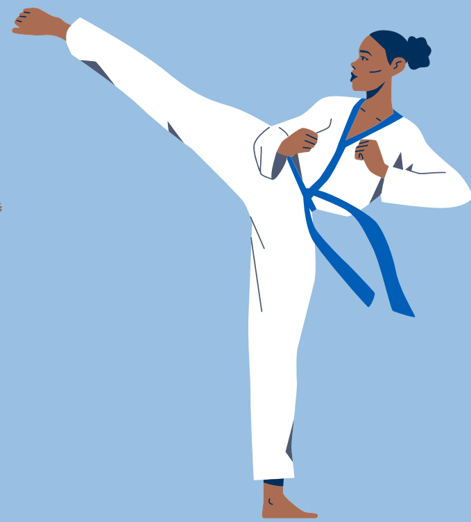
le judo judo